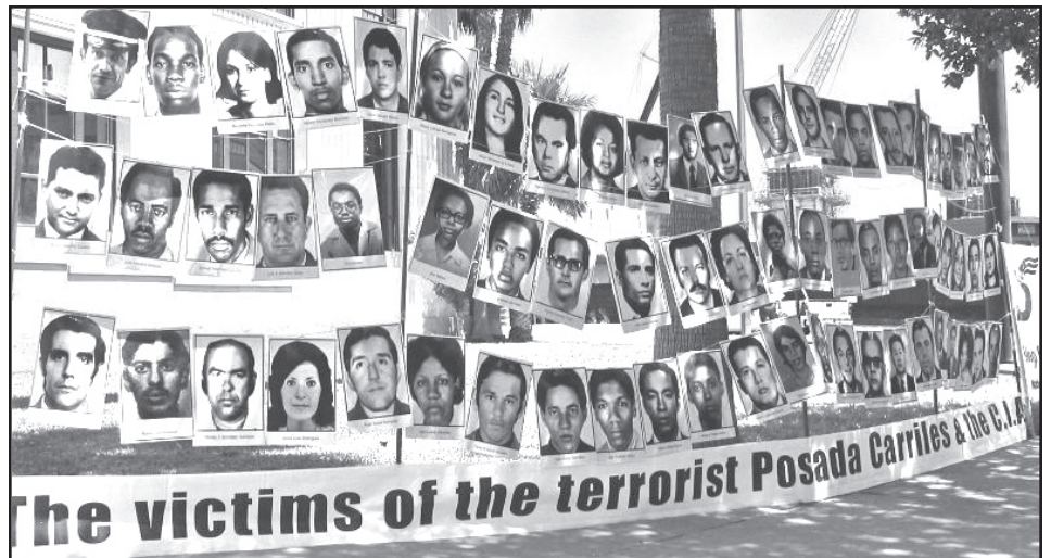
Pictures of the 73 people killed in 1976 plane bombing masterminded by Posada

On March 1, Luis Posada Carriles goes on trial in El Paso, Texas. He is being charged with perjury for lying to U.S. officials about his role in the bombings of several Havana hotels. However, the U.S. government refuses to prosecute or extradite Posada for his terrorist acts, even though there is substantial evidence of his role in: